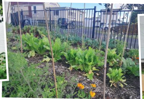
Progress in the garden