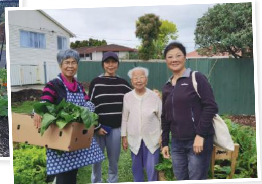
Community volunteers gathering fresh produce